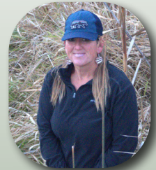
Rue Hewett Hoover