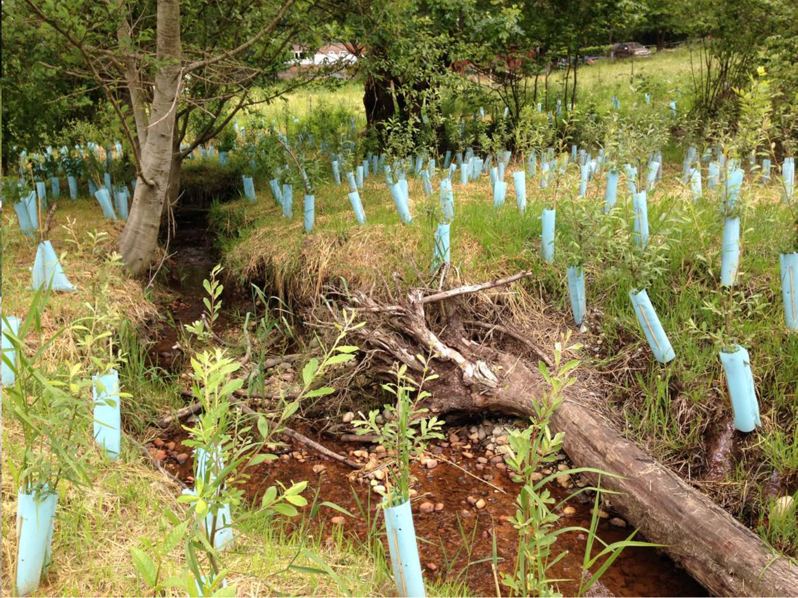
Bridge, LWD, and planting