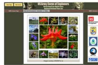
A presentation given during a webinar.

Stream Identification/Delineation/Mitigation Project