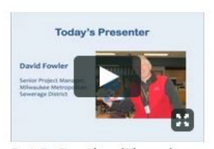
Part 5: Questions/Discussion