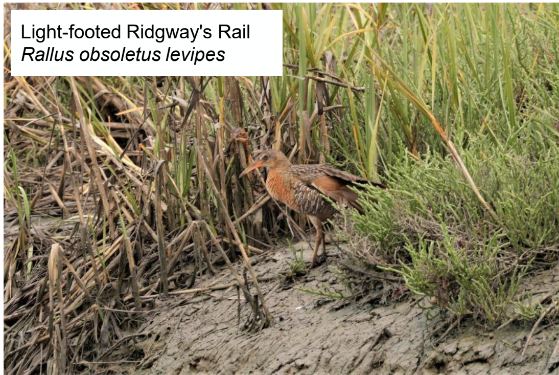
Light-footed Ridgway's Rail Rallus obsoletus levipes