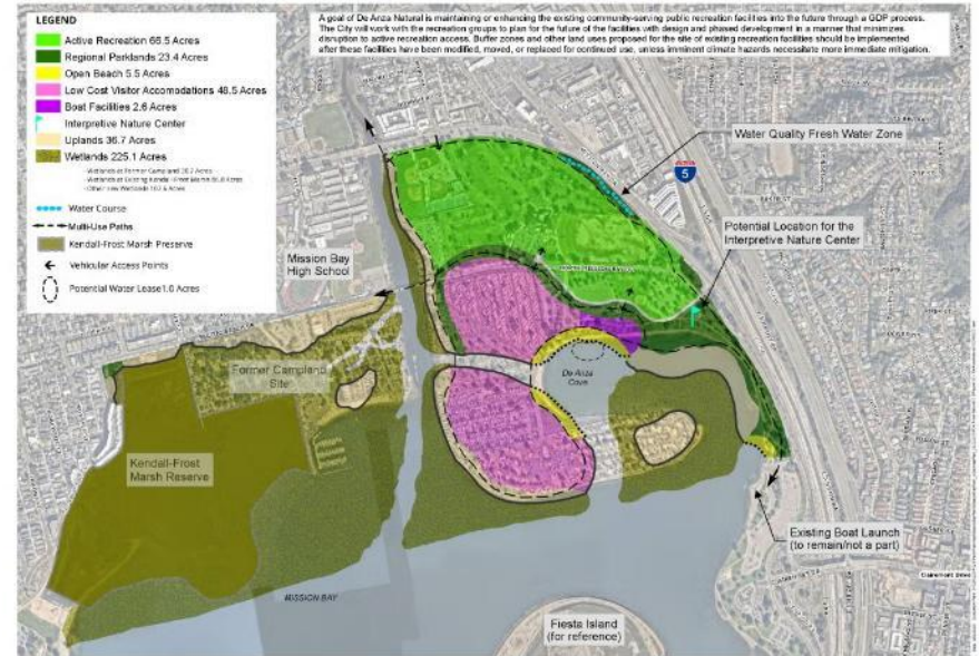
De Anza Natural De Anza Cove Amendment to the Mission Bay Park Master Plan Figure 3: Site Plan