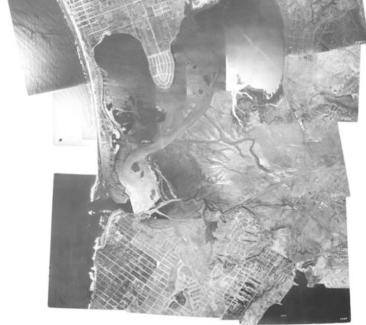
Figure 7. 1928 aerial photograph mosaic of Mission Bay and surroundings.