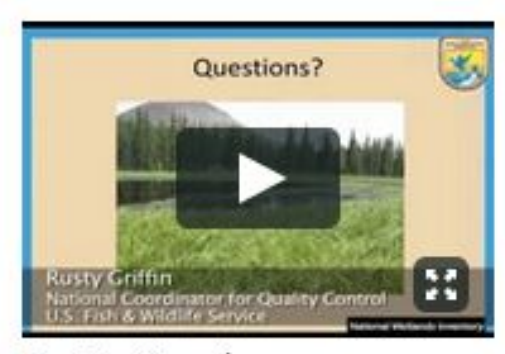
Part 3: Questions