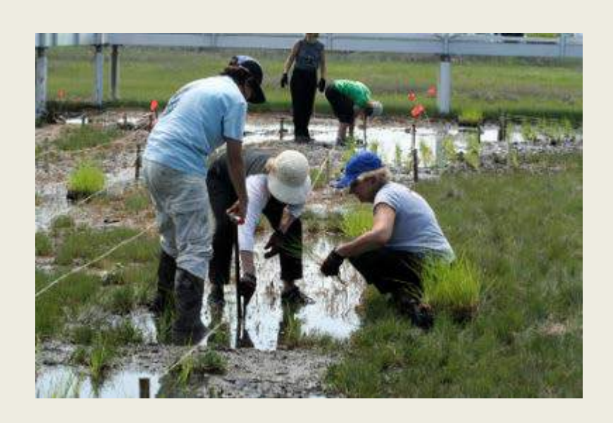
Wednesday, November 9, 2016 3:00 pm – 5:00pm Eastern