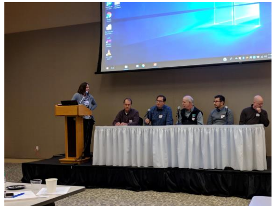
2018 NFFA-WMC Workshop in Silver Spring, MD

overall goal of the initial workshop was to discuss current and potential opportunities to integrate geospatial mapping and functional assessments of coastal and riparian wetlands and floodplains, to improve land use decisions and resource management and to reduce risk from the impacts of flooding, sea level rise and other extreme weather events.