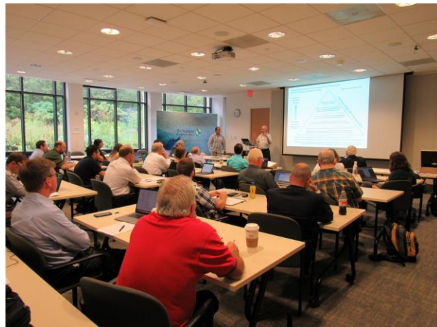
2019 NFFA-WMC Workshop in Arlington, VA

Group discussions unpacked some of the information shared in the presentations and provided the participants a chance to identify gaps, needs and next steps. Three discussion topics were included: 1) identifying datasets, databases, models, and approaches that are applicable to each level of the pyramid and levels of agency/organizational involvement; 2) identifying priority functions for assessment and methods for quantifying/scoring function provision; 3) identifying key agencies/organizations and others for implementation and useful resources, publications, and projects.